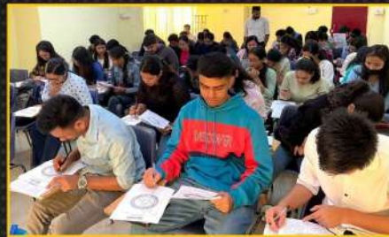
Test Series Exams