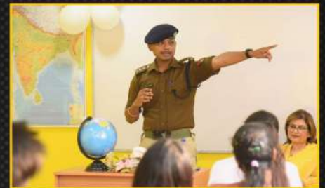
Guidance By Bureaucrats