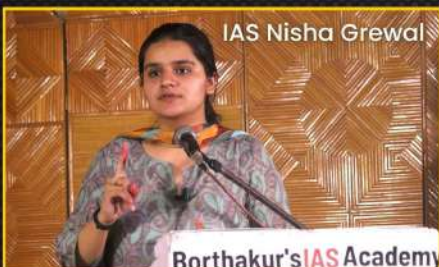
Tips By IAS Officers